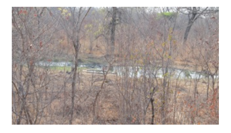
A watering hole where Jewel saw the five bull elephants drinking the water.