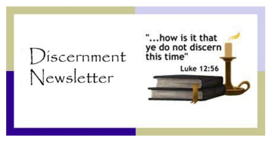
Volume 7, Number 5 October/November/December 1996