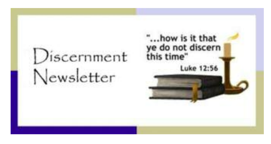
Volume 5, Number 2 March/April 1994