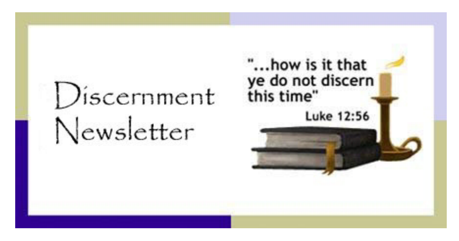
Volume 3, Number 5 October/November/December 1992