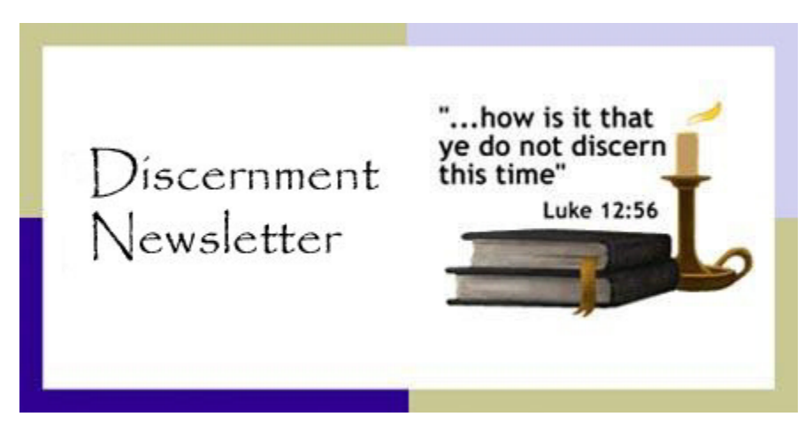
Volume 3, Number 2 March/April 1992